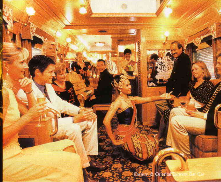
Eastern &amp; Oriental Express Bar Car