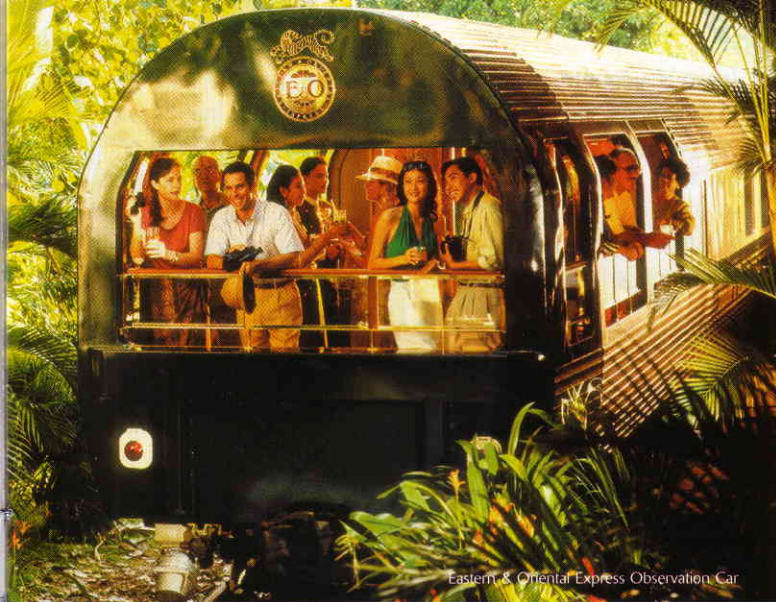
Eastern &amp; Oriental Express Observation Car