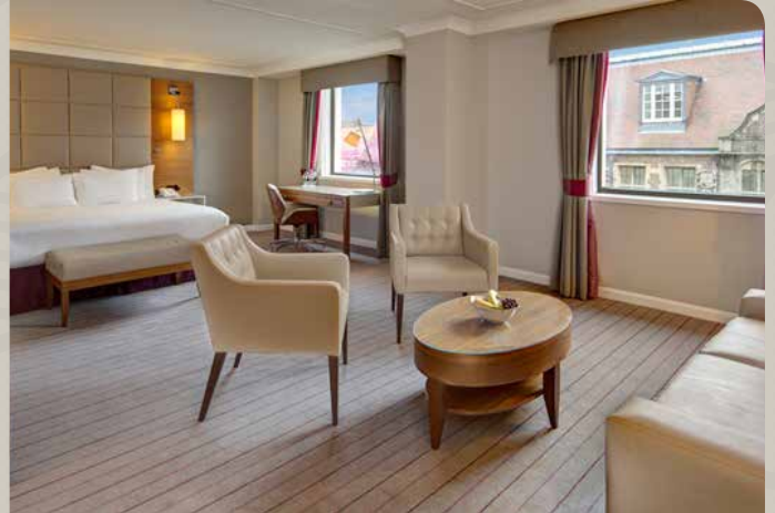
Hilton City Centre Hotel, Cambridge