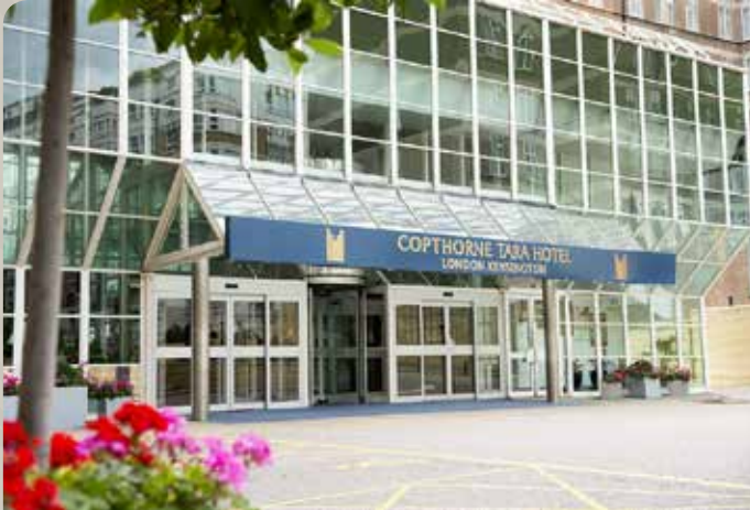
Copthorne Tara Hotel, London

The properties we have selected have been hand-picked based on their location, customer feedback, value and atmosphere. Here's some of what you can expect on this tour: