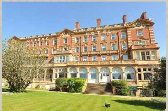
Queens Hotel, Portsmouth