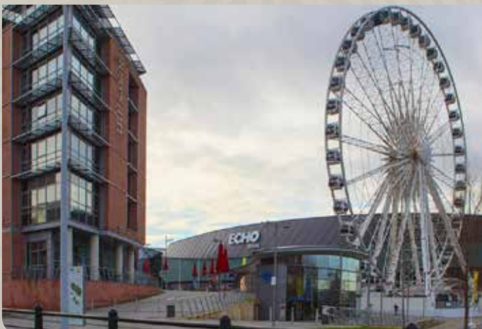
Jurys Inn, Liverpool