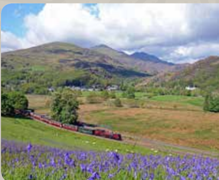
Ffestiniog Railway, North Wales

Being rail enthusiasts we know that the journey itself is often more important than the destination. Wherever possible we have sourced interesting and nostalgic rail journeys and other noteworthy modes of transport. Here is an example of what you will experience: