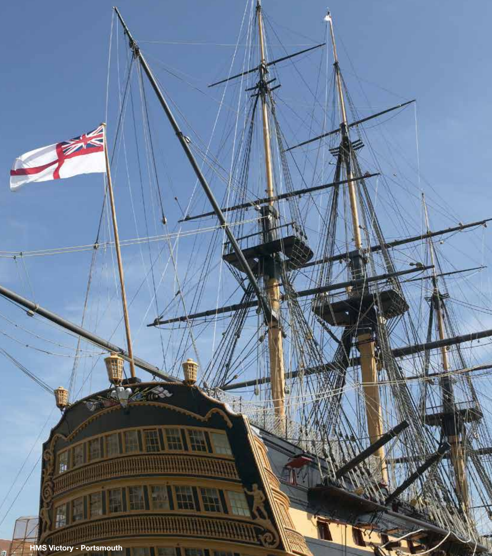
HMS Victory - Portsmouth