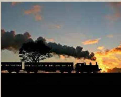
Isle of Wight Railway