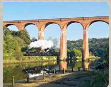
North Yorkshire Moors Railway