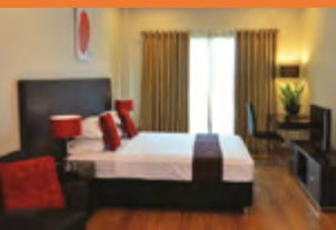
Hotel Timor Plaza

6 Day Scenic Drive Package starts from US $1,328pp twin sharing