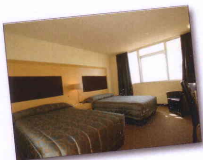
EXTRA NIGHTS ACCOMMODATION (RRP $100)

Book with Guidepost Tours on one of Grand Pacific Tours' Rail or Steam Train Holidays and for only $100 you can receive the following*: