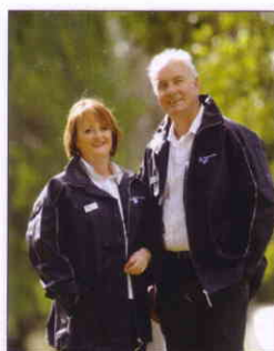
WATERPROOF TOURING JACKET (RRP $58)